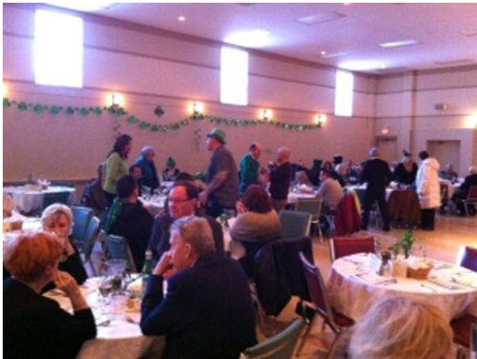
A good time was had by all at the dinner/dance.