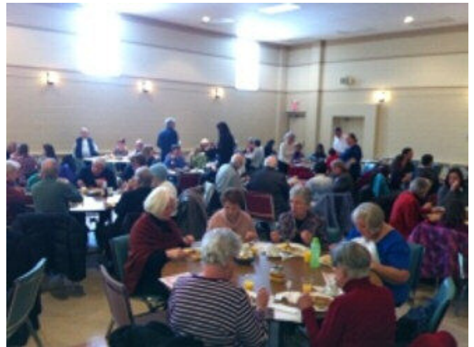
St. Patrick's Parish also held a dinner/dance on March 15 to celebrate the Patron Saint of their parish.

Although this was a "parish event," the Knights were called in to help. We were able to provide support for the event which included ticket sales, hall set up, decorating, meal serving (not cooking), busing of tables and clean up.